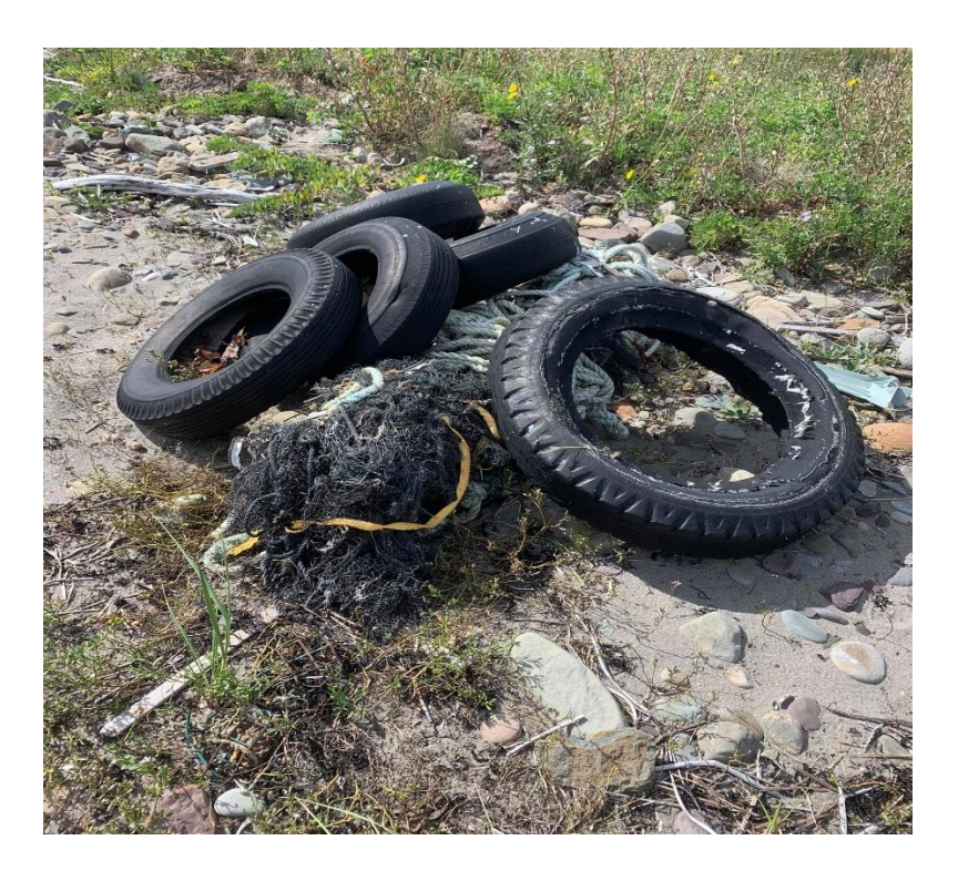
Figure 3. Tires, rope and other debris on Ferguson's Beach, Sept. 21st 2020.