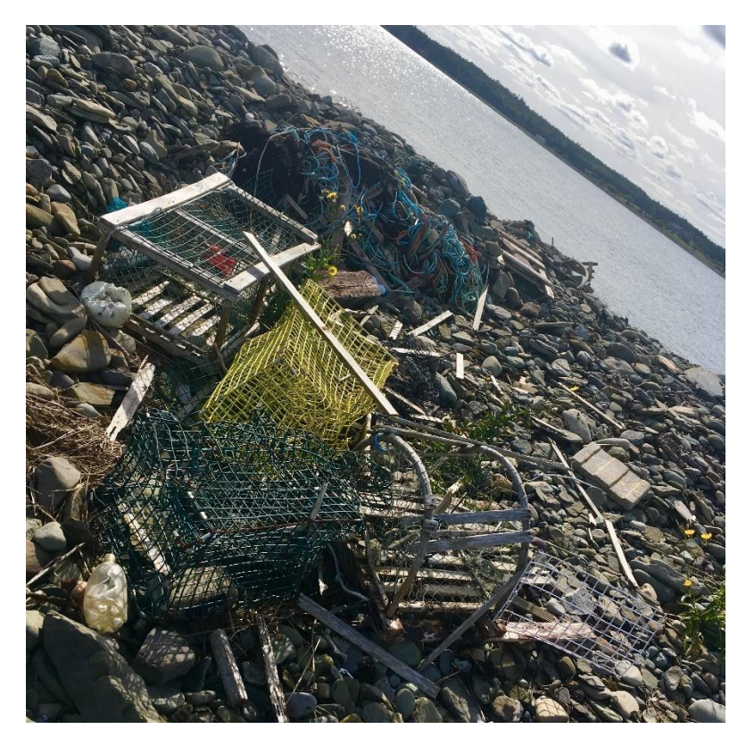
Figure 2 . Fishing related debris on the Waddens Cove Shoreline, Sept. 21<sup>st</sup> 2020